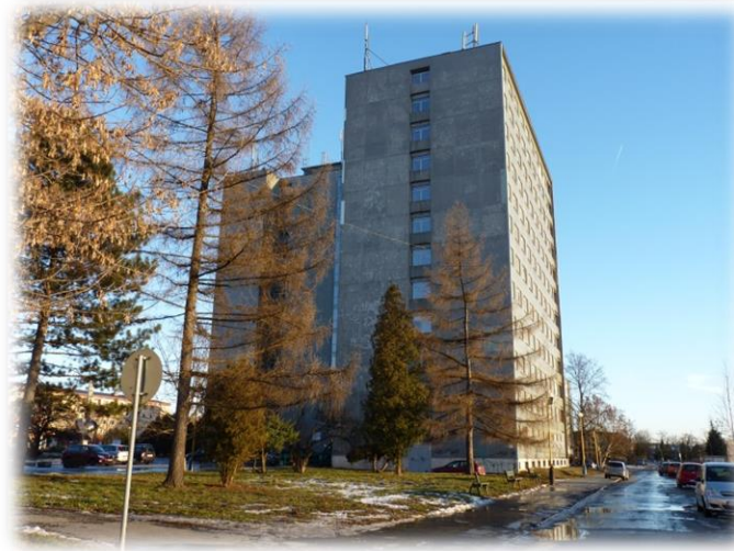
Halls of Residence